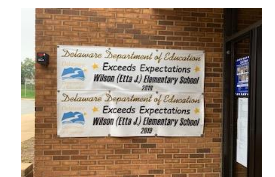
2019 & 2018 Department of Education Exceeds Expectations School

2018 National Elementary and Secondary Education Act (ESEA) Distinguished School