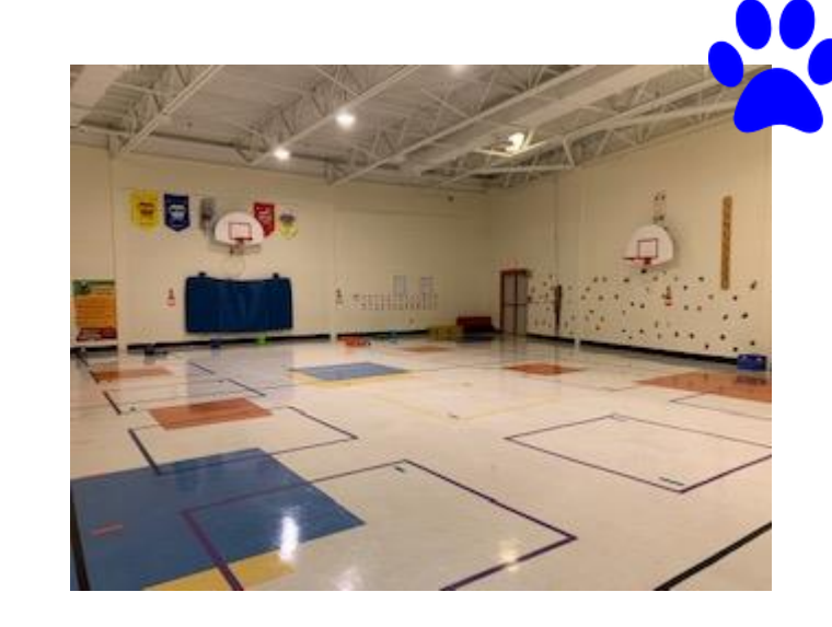
Physical Education & Health