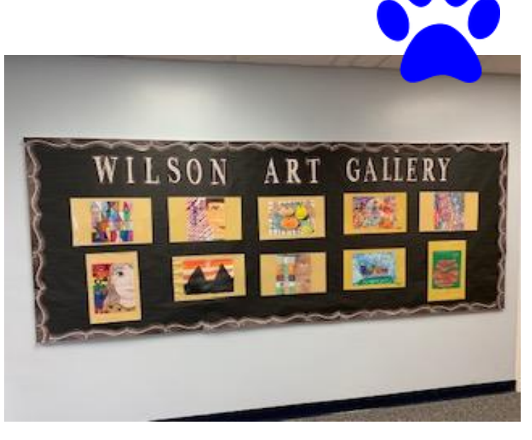
Wilson Art gallery