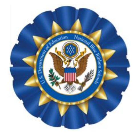
2020 National Blue Ribbon School